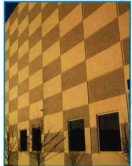
Fabcon's VersaCore Plus™ panels help customers improve energy efficiency while maintaining optimum design flexibility.

When measuring wall system R-values in various parts of a building, a sector's