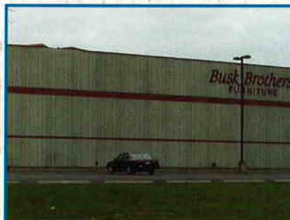
Following an F3 tornado, Busk Brothers' precast building, utilizing Fabcon's VersaCore™ panels, sustained only minor cosmetic damage. Adjacent buildings, such as the one on the left, were severely damaged or destroyed.